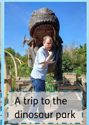
A trip to the dinosaur park