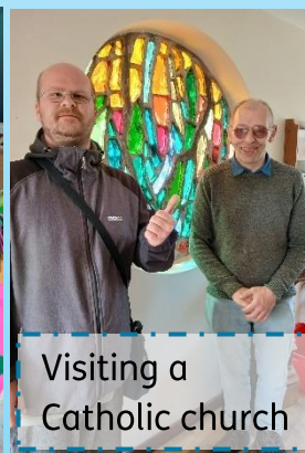
Visiting a Catholic church