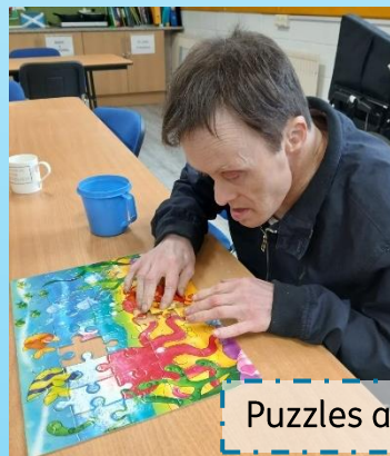
Puzzles and painting