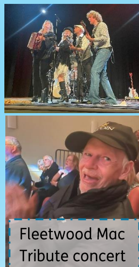
Fleetwood Mac Tribute concert