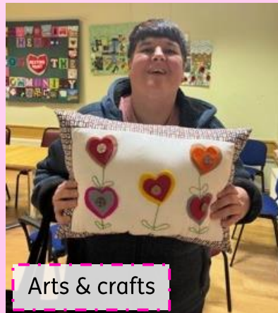
Arts & crafts