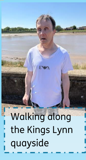
Walking along the Kings Lynn quayside