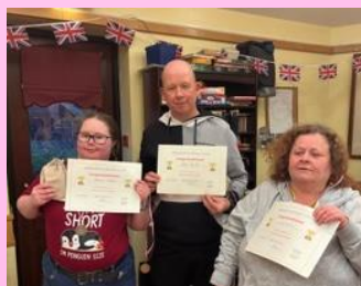
Quiz and chips night