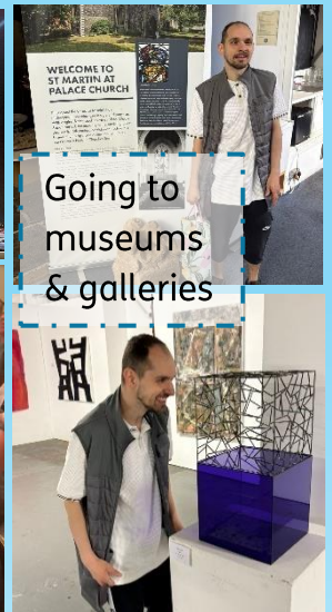
Going to museums & galleries