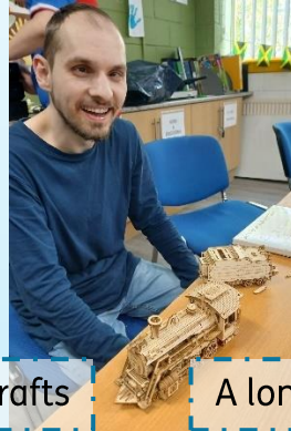
A long walk out in nature